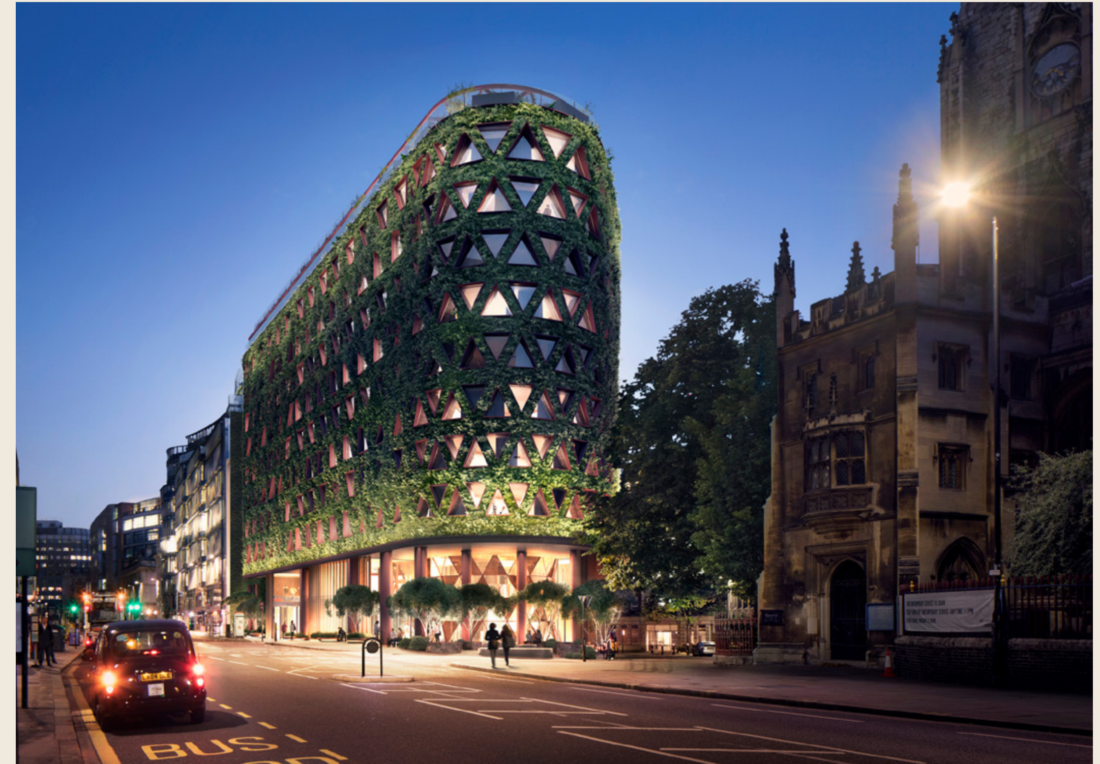
02. Citicape House