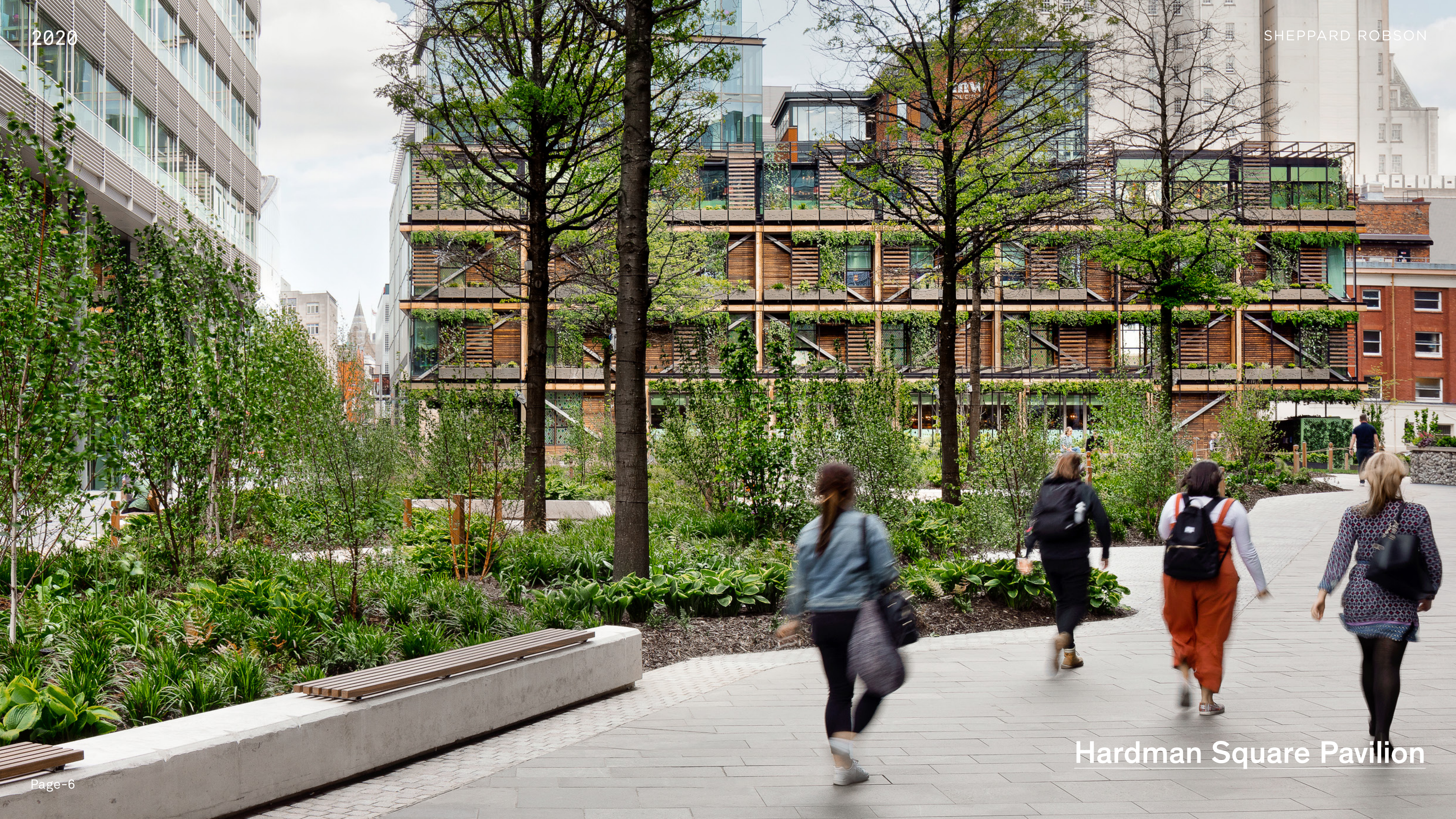
Hardman Square Pavilion