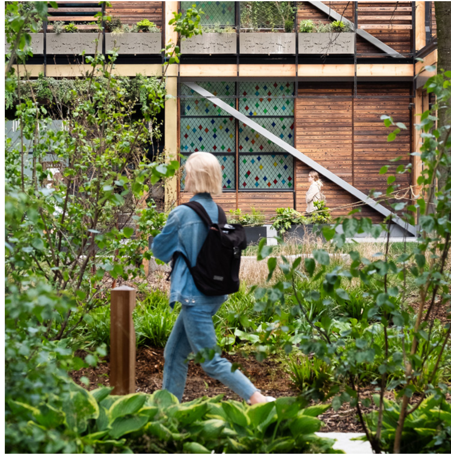
01. Hardman Square Pavilion

Designed by Sheppard Robson's interior group, ID:SR, Deloitte's 270,000ft 2 addition to its London campus embraces agile working and an intelligent building system to drive efficiencies and set new standards for wellness and sustainability, becoming the largest WELL Gold, New and Existing Interiors project worldwide, and the first to achieve both BREEAM Outstanding and WELL Gold.