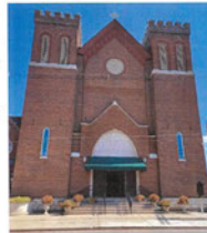
ST. PATRICK CHURCH 280 N. Grant Ave. Columbus

Join the beauty of grace in how we teach faith to Downtown Columbus, with and through Our Lady.