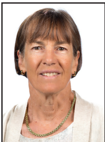
TARA VANDERVEER HEAD COACH 35TH YEAR