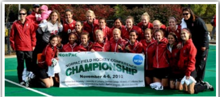
2010 NorPac Tournament Champions