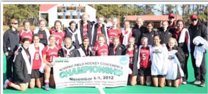
2012 NorPac Tournament Champions