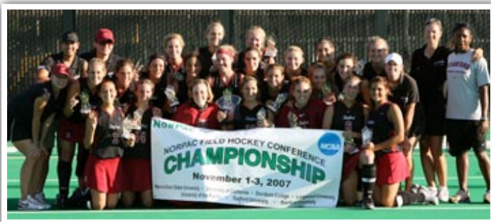
2007 NorPac Tournament Champions