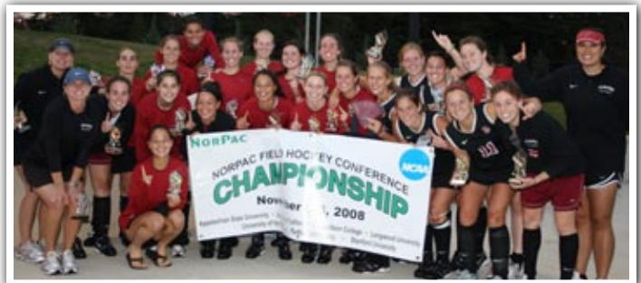
2008 NorPac Tournament Champions