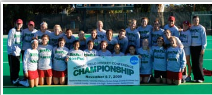
2009 NorPac Tournament Champions