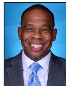
HUBERT DAVIS Assistant Coach 6th Year at UNC