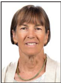
TARA VANDERVEER HEAD COACH 33RD YEAR