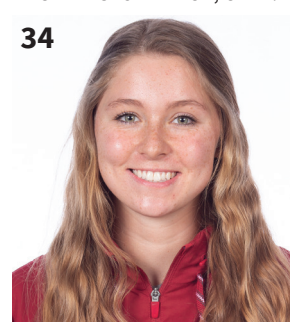
FR | UTL | 5-5 | L/R VIENNA, VA.