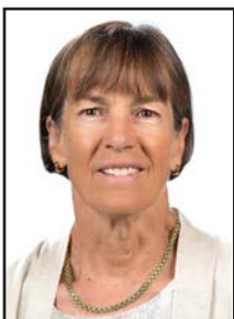
TARA VANDERVEER HEAD COACH 33RD YEAR