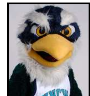
Sammy C. Hawk Mascot