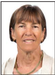
TARA VANDERVEER HEAD COACH 32ND YEAR