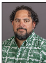
Eti Ena Co-DC/DT FIELD