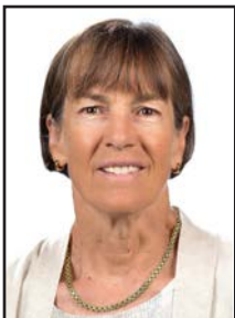
TARA VANDERVEER HEAD COACH 33RD YEAR