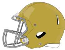
#9/9 Notre Dame Fighting Irish (9-2)