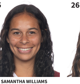
JR | F | 5-4 LAGUNA BEACH, CALIF.