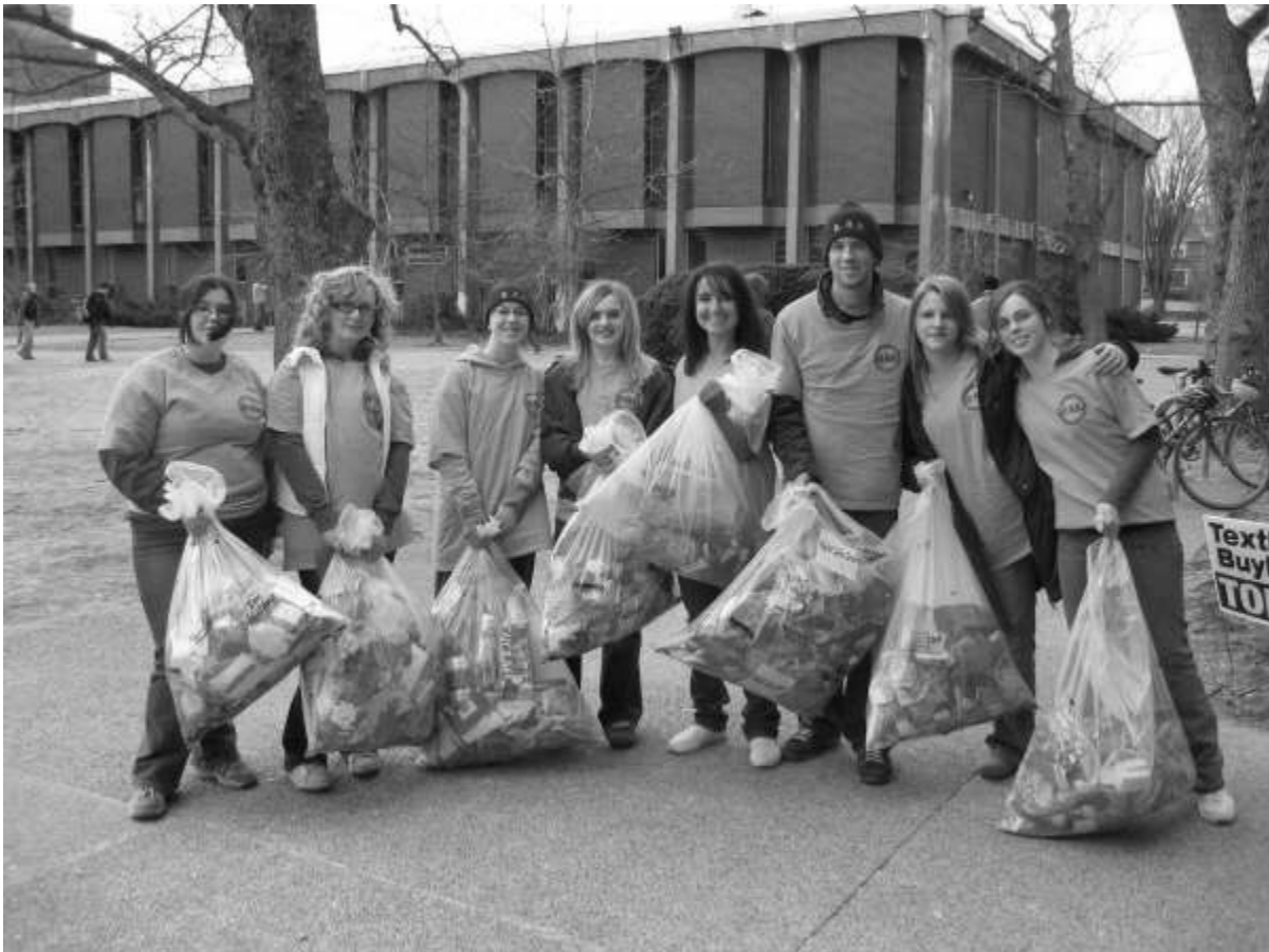
The Saint Mary's University Random Acts of Kindness (RAK) Squad celebrated another successful year with an end-of-semester neighbourhood litter cleanup on April 4, 2007. Among other activities during the past year, the student volunteers organized a community clothing drive for Hand-in-Hand Outreach, participated in the annual FEED Nova Scotia stuff-a-buss food drive and brought International RAK Week to the Saint Mary's campus.

It is the responsibility of all members of the University community - students, faculty, administrators, and staff - carrying out research involving human subjects to seek approval from the University Research Ethics Board (REB) for their research. Student submissions to the REB should be made through the thesis supervisor. For further information, please consult the REB website: www.smu.ca/academic/reb .