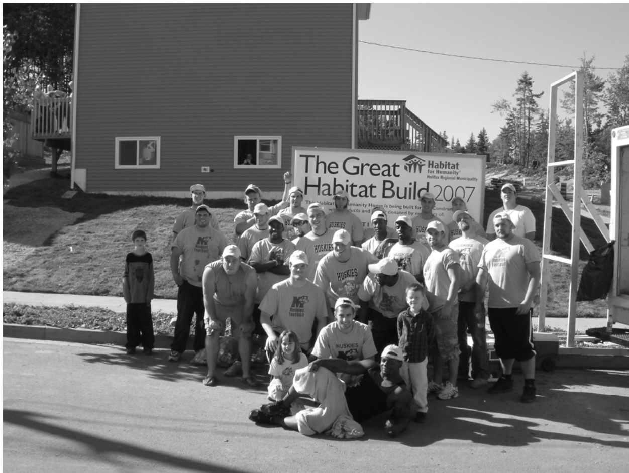
Members of the Huskies Football displayed their community spirit on September 23, 2007 by participating in the Habitat for Humanity Build.