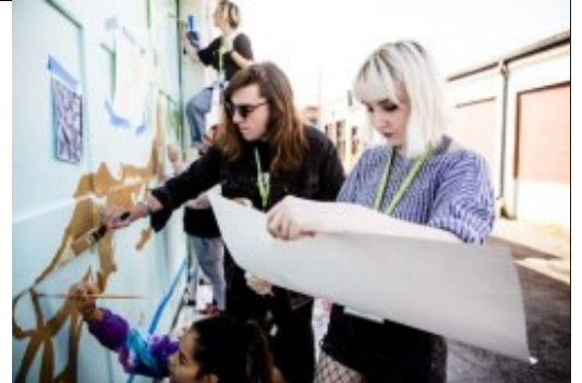
C2C Students served at Hummingbird Inclusive Art Studio

New Student Orientation Action Day was organized in collaboration with United Way's Day of Caring. Students got to know local organizations and each other. 251 students served at 16 off campus organization sites for C2C Day of Caring 2017, for a total of 753 volunteer hours. New Student programs coordinated on campus service with a total of 458 students.