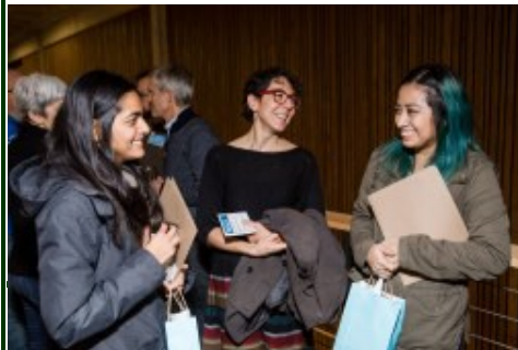
Celebrating a huge milestone :

CBL is vital to the curriculum. It is an analytic centerpiece for students and faculty learning. This includes the broad arena of Community Based Research with its many applications in community studies, anthropology, public interest law, public health, social justice, etc. CCBLA strengthens much needed connections to the public providing the essential base for our approach to higher education at Evergreen. Local organizations and CCBLA are tied together in a form of educational mutual aid.