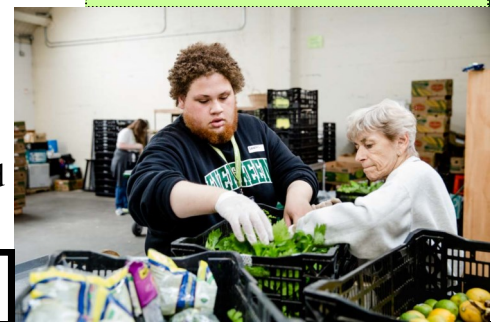
Evergreen Volunteer at Downtown Thurston County Food Bank site .

The volunteer run Thurston County Food Bank (TCFB) Satellite at CCBLA served over 788 Evergreen students and community members. A new WACC AmeriCorps VISTA position was created by CCBLA and TCFB and recruited 17 volunteers who served 254 hours.