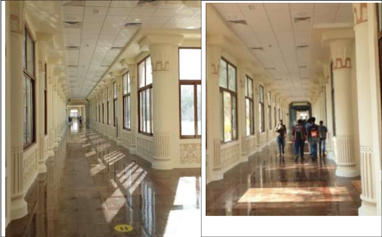
Example of Covered Pedestrian Corridor