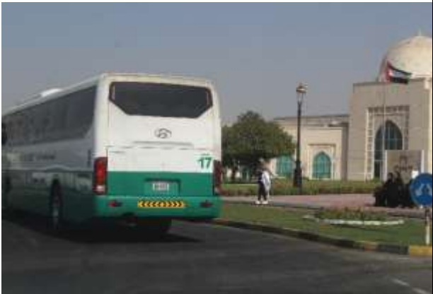
Sharjah University City (City) Bus