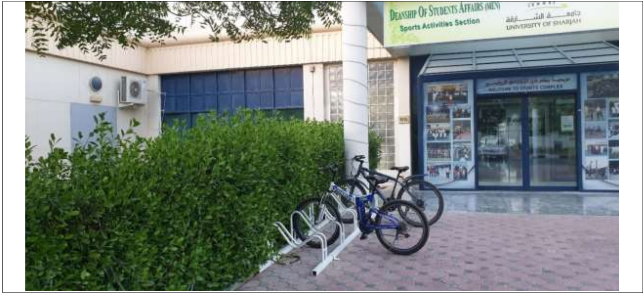
Example of a Bike Rack at UoS Men Campus