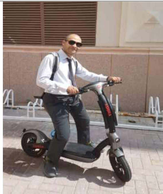
Example of Electric Scooter Used Around Campus