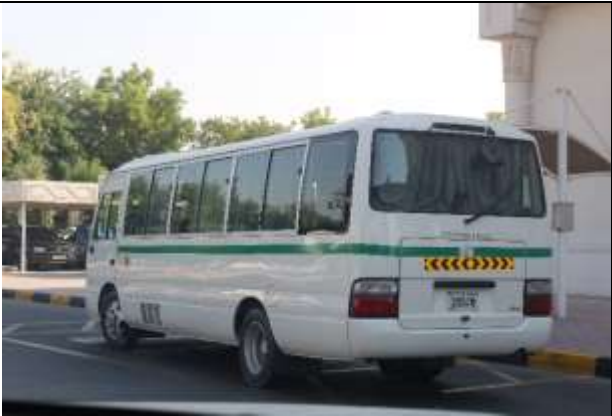
University of Sharjah Shuttle