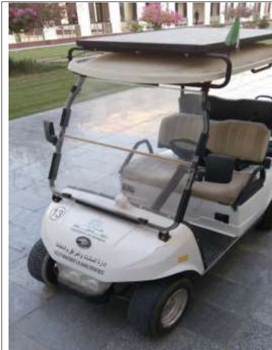
Example of Electric Golf Cart Used by Facilities Department