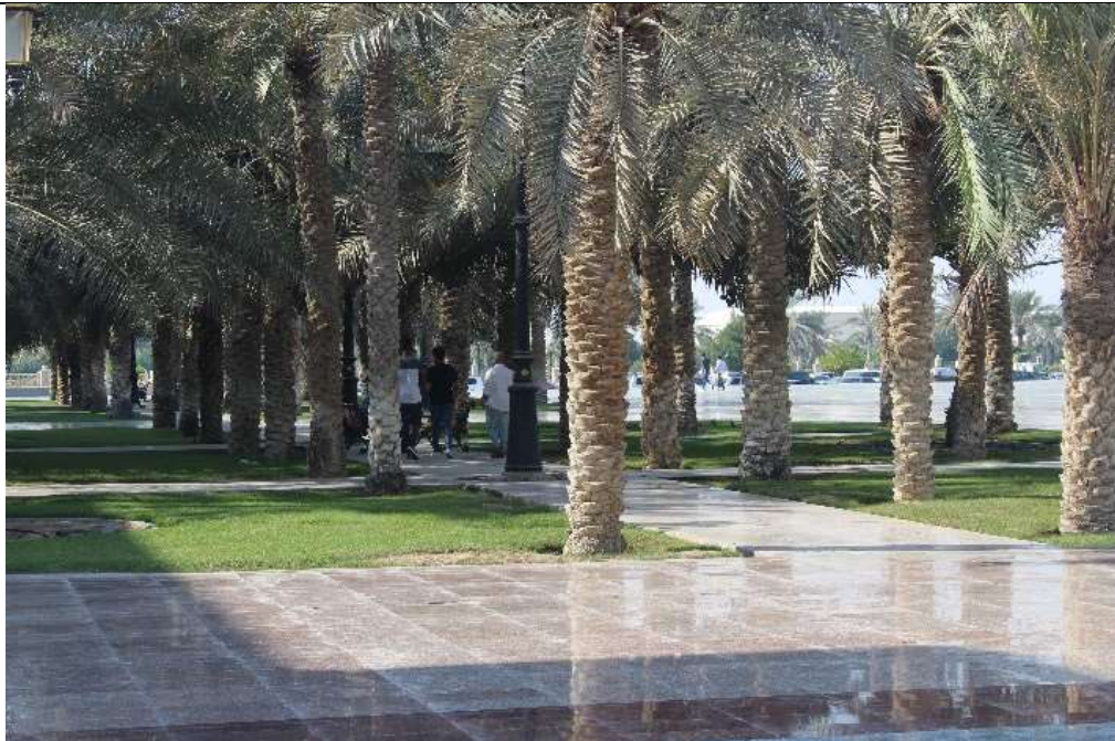
Example of Palm-Tree Pathways