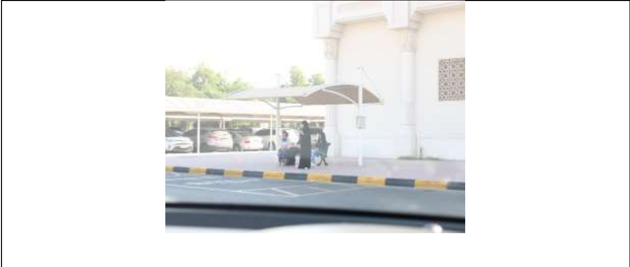
Covered Bus Stops/Shelters