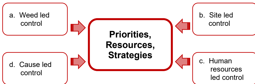
Figure 1- Weed Management Approaches

The challenge for integrated weed management is to look at weed control from all angles, to fully consider the range of possible approaches and then to decide the combination of approaches which will maximise outcomes. A strategic approach that assigns priorities towards implementing the strategy.