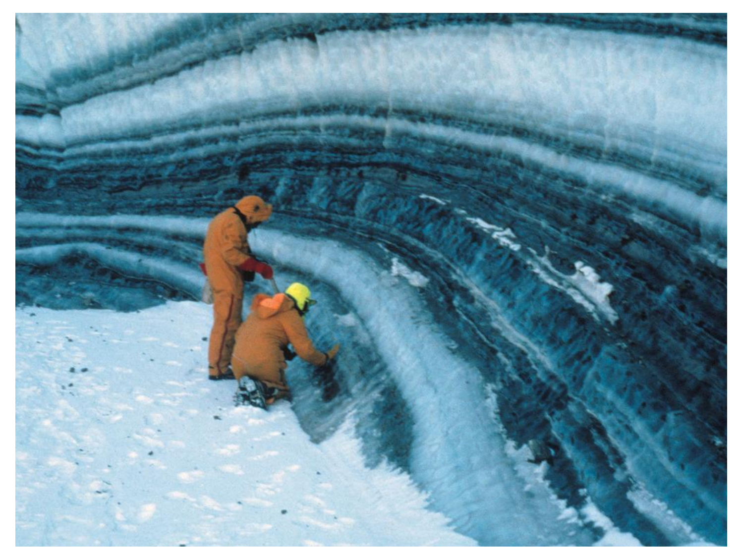
Antarctic research.

UTAS's support for climate action is evident in other ways as well. Global Climate Change Week, for example, is supported by the university's Sustainability Committee and fits with its commitment to be a global leader in climate research, communication and action.