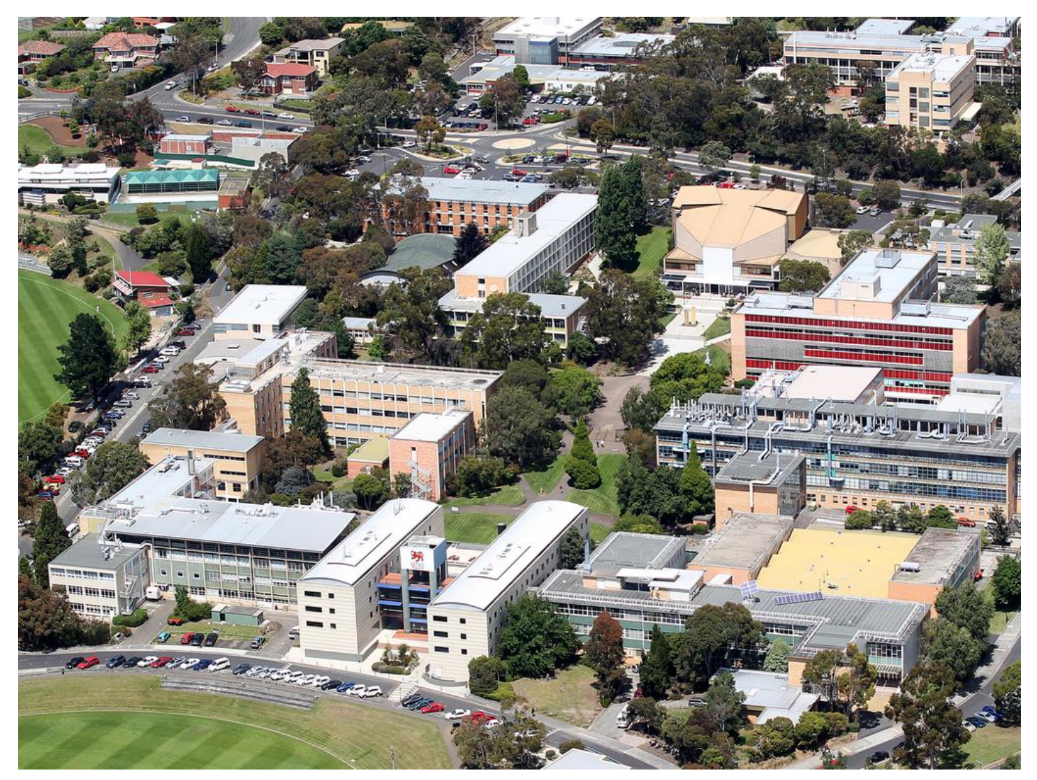
The University of Tasmania's Sandy Bay campus.

So what does climate action leadership at universities look like?