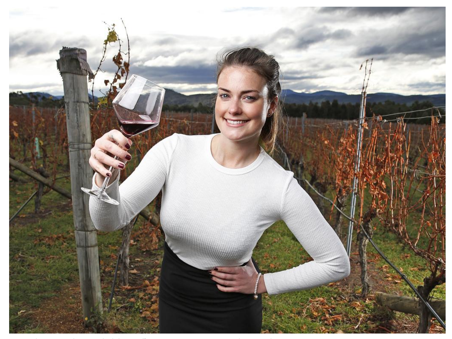
UTAS and Wine Australia researched climate effects on wine regions.

The best green credentials for UTAS will also include things such as generating its own renewable energy, enabling sustainable transport and ensuring its purchasing aligns with the UN's Sustainable Development Goals.