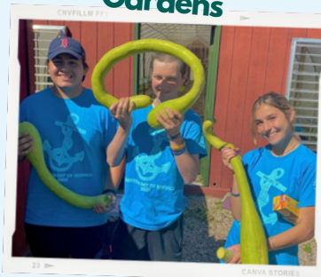
God's Community Gardens