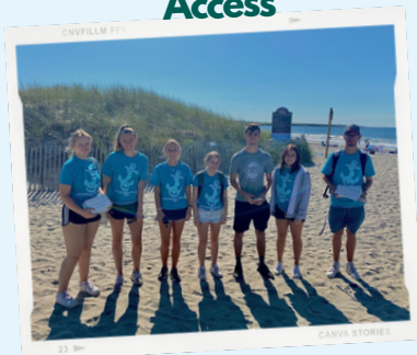
Clean Ocean Access