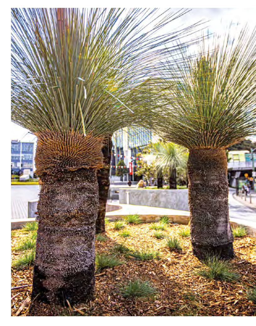
The planting of native Gadi trees on our Camperdown Campus honours the place where the University resides and the traditional landowners, the Gadigal People of the Eora Nation. It has also resulted in the return of native bees to the campus.