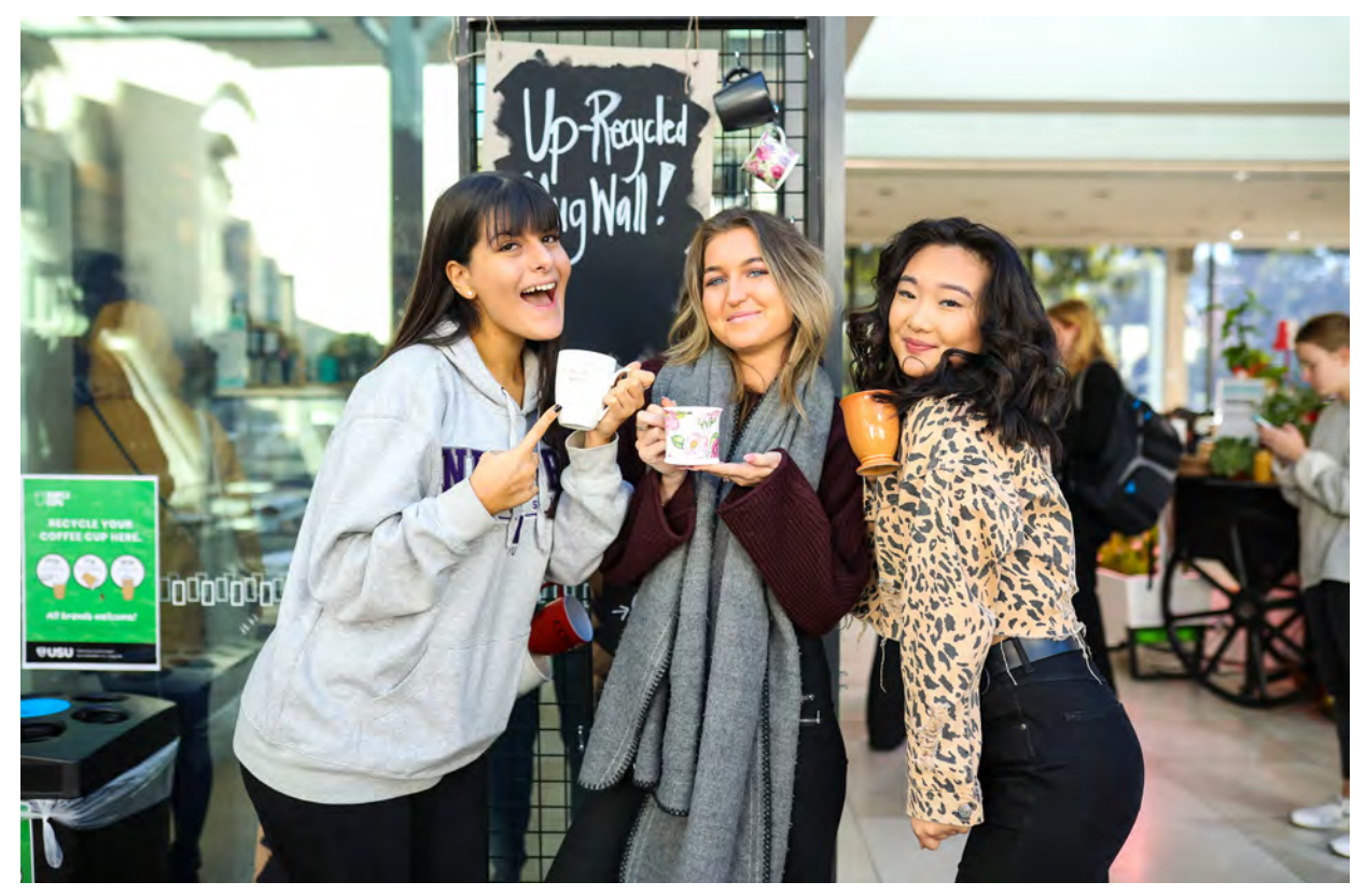
The University of Sydney's Student Union, USU, already offers discounts for bringing your own mug to its campus cafes, and also offers ceramic mugs customers can borrow if they've forgotten their own cup at their Courtyard Cafe (bottom). The Courtyard Cafe also features an edible micro-greens wall by Farmwall (top).