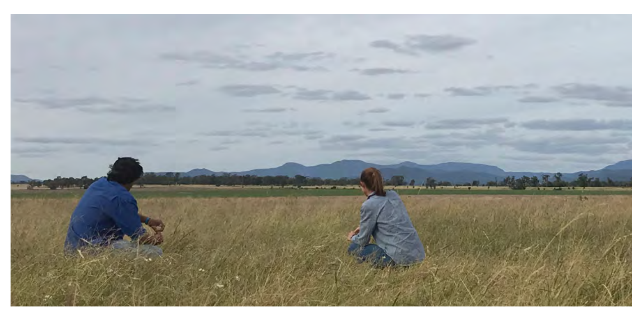
To mark National Reconciliation Week 2020, our scientists, architects, alumni, and an Indigenous architectural graduate collaborated to present a vision for how we can respect land and community at our Narrabri Campus, showcasing the importance of Australian native grasses in food production.

Under this strategy, we will work to bring our researchers, students and professional staff into an interface of research-education-operations that will be a unique driver and demonstration of our sustainability work and, ultimately, contribute to a positive long-term sustainable future for our nation. By putting world-leading research into practice, trialling new research within living labs, and providing new opportunities for our students inside and outside the classroom, we will place sustainability at the heart of our core activities of research and education.