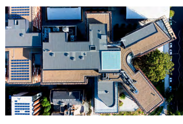
The University of Sydney currently has rooftop solar systems installed on 20 buildings, which generates more than 1 MWh (1000 kilowatt hours) of solar energy per annum.

<sup>3</sup> Net-zero emissions, sometimes called carbon neutrality, refers to not emitting more greenhouse gases into the atmosphere than the earth's systems can naturally absorb. At the University of Sydney, our net-zero goal refers to emissions attributed to Source 1 and 2 energy use across all of our campuses by 2030 (as defined by the National Greenhouse and Energy Reporting Act 2007 (NGERS)). Emission totals are as per our Tertiary Education Facilities Management Association (TEFMA) and NGERS submission.