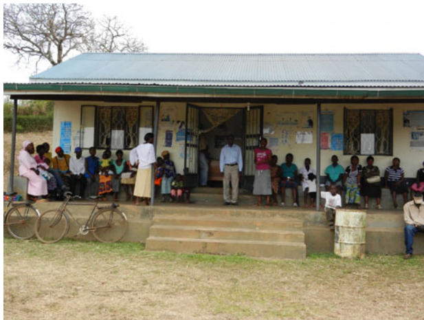
PLATE 1 Kibale Health and Conservation Centre, adjacent to Kibale National Park, Uganda (Fig. 1).

*Including, but not limited to, open cuts, burns, boils, abscesses, pyomyositis, and mast infections.