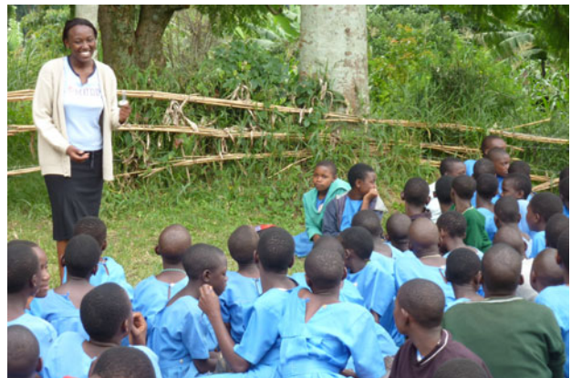
PLATE 2 The nurse from the Kibale Health and Conservation Centre giving an outreach talk at a local school.

A common criticism of conservation programmes that aid local communities and improve economic welfare is that they promote immigration and increase population growth near the protected area. For example, Struhsaker et al. (2005) estimated that 47% of tropical protected areas in Africa had