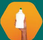
DISHWASHING LIQUID PLASTIC BOTTLE