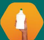
DISHWASHING LIQUID PLASTIC BOTTLE