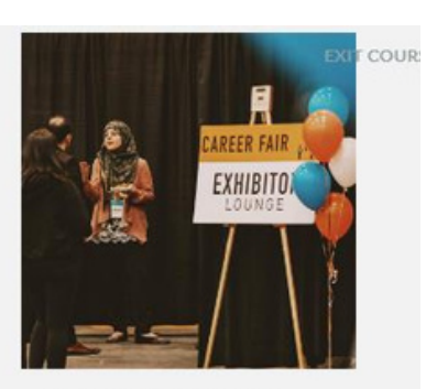
UFV students at the UFV Career Centre Career Fair in 2019.

Boost your confidence, explore your passion, and grow your skills with opportunities at UFV. Here are some ways to get started.