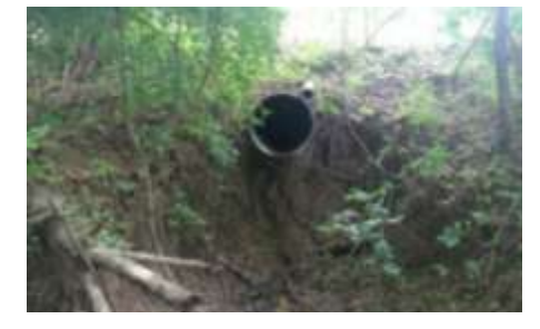
Figure B.1. The above outfalls are examples of different types of outfalls that must be identified on MS4 maps and included in the permittee's screening program. Areas with highly developed land uses (e.g., commercial business complexes, aging infrastructure) have a greater potential to pollute and must be prioritized. Structural stability and erosion concerns should also be identified as part of an effective IDDE program.

Permittees must develop SOPs that outline methods to conduct dry weather outfall inspections, locate