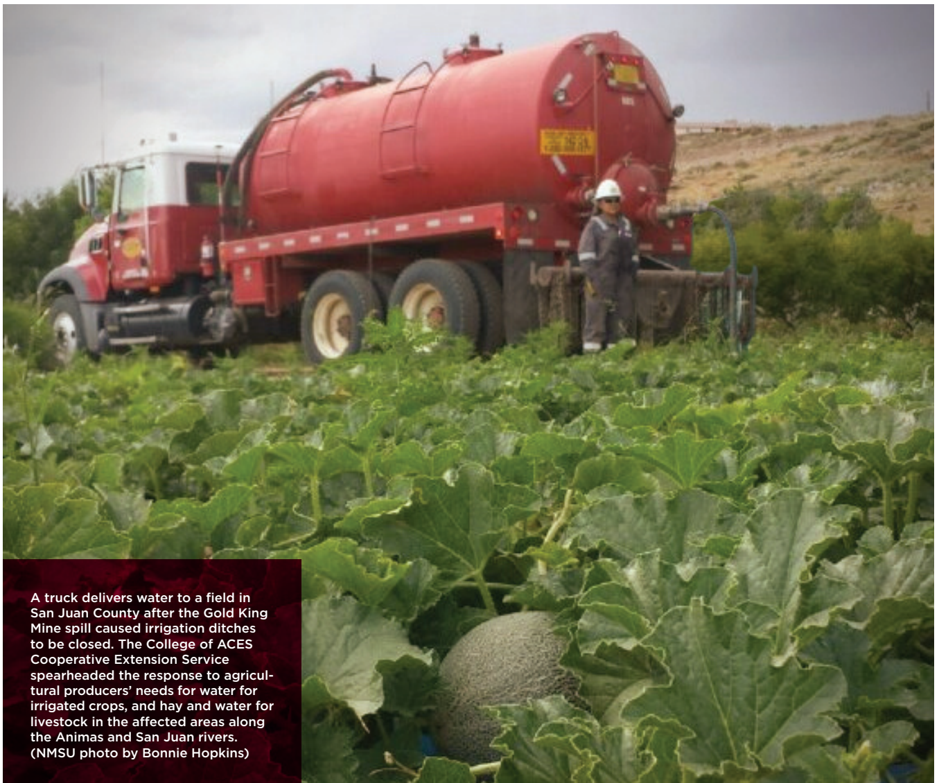
A truck delivers water to a field in San Juan County after the Gold King Mine spill caused irrigation ditches to be closed. The College of ACES Cooperative Extension Service spearheaded the response to agricultural producers' needs for water for irrigated crops, and hay and water for livestock in the affected areas along the Animas and San Juan rivers.