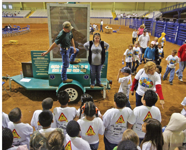
Children listen to a presenter during a recent Progressive Agriculture Safety Day in Clovis.