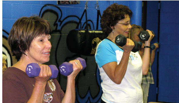
StrongWomen Strong Bones participants work out in Española.

of all ages, are reached every year by Extension’s community classes and workshops on nutrition, parenting and physical fitness.