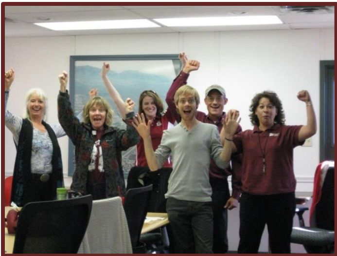
Volunteers that got us to STARS Gold!

We have modeled the committee structure of our Sustainability Council after these three divisions.