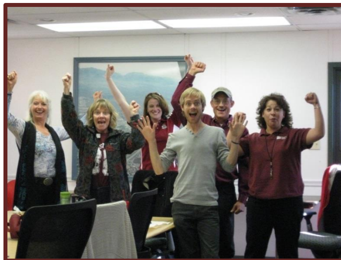
Volunteers that got us to STARS Gold!

We have modeled the committee structure of our Sustainability Council after these three divisions.