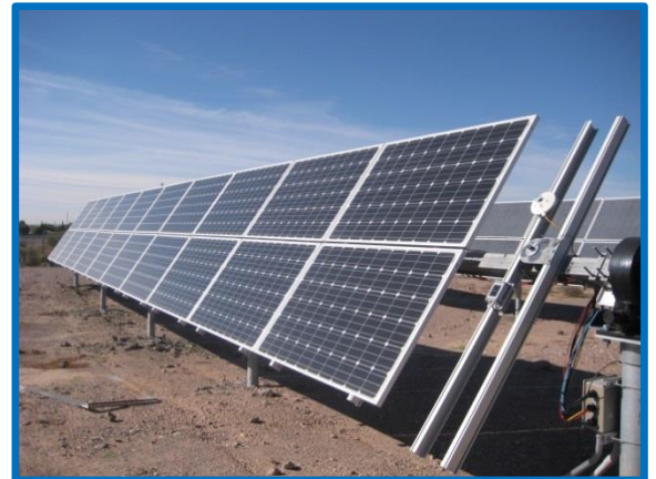
Solar panels at SWTDI test facility

SWTDI provides training and contract engineering services for systems analysis, hardware development and evaluation, and feasibility studies, and computer modeling, and informational kiosks. SWTDI performs contract engineering for a wide variety of private and public sector clients, including research organizations, utility companies, and local, state, and federal government agencies. Ever changing and developing as needs for research and outreach change, in 2011 SWTDI became part of the Klipsch School of Electrical and Computer Engineering.