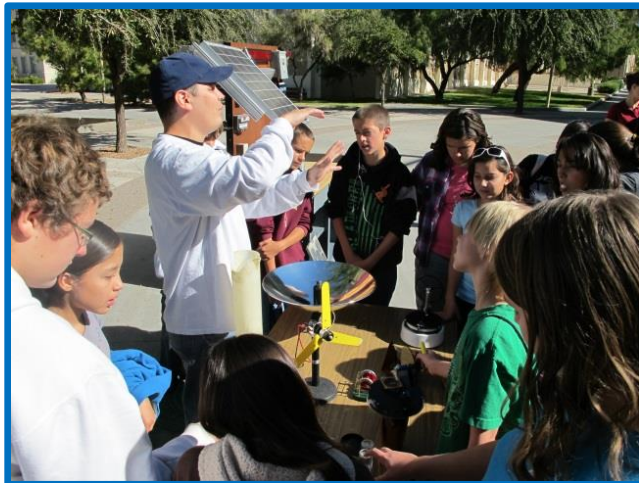
Faculty teaching grade school students about solar

The Institute for Energy and the Environment includes WERC, a consortium for environmental education and technology development, Southwest Technology Development Institute, a renewable energy research and development group, and Carlsbad Environmental Monitoring and Research Center, a nuclear waste-management and monitoring center.