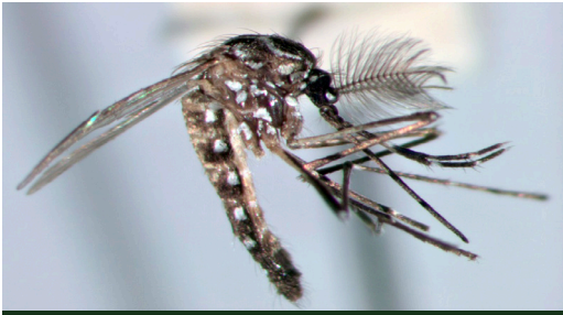
Aedes Aegypti, Male