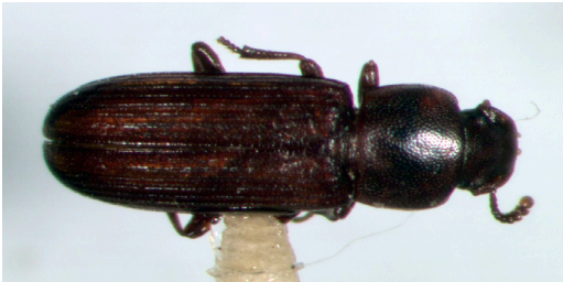
Confused Flour Beetle