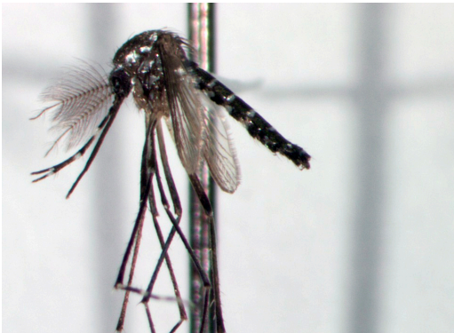
Aedes Albopictus, Male