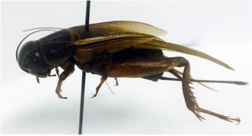
Cricket - Field