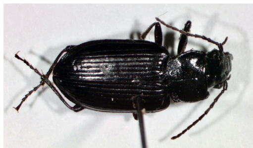
Ground Beetle, Carabidae