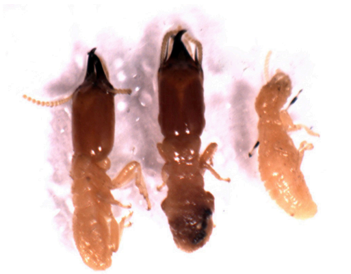
Soldier and Worker Termites