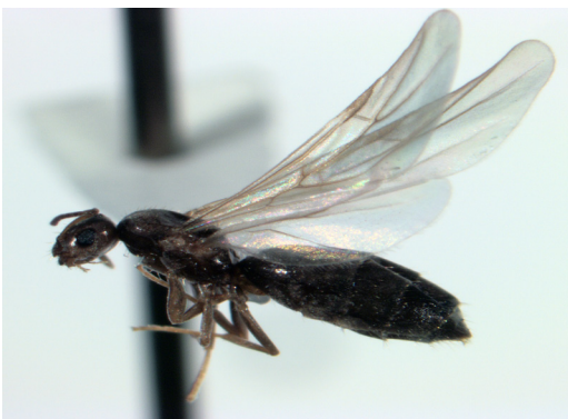
Rover Ant Swarmer