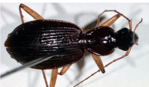
Ground Beetle, Carabidae