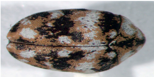
Dermestid Beetle, top view