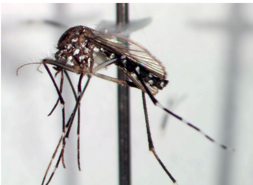
Aedes Albopictus, Female

Sampling should take place at least once a week, and always on the same day, at the same sites, and at the same time. Counts of species, sex, and life stage should be recorded.