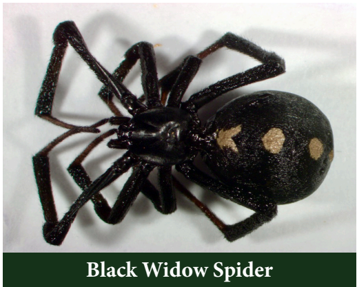
Black Widow Spider