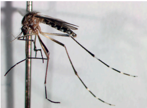
Aedes Aegypti, Female