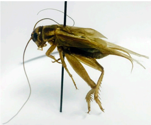
Cricket - House

Crickets are a common household invader. They spend most of their life outside where they feed, and reproduce. They can wander indoors and become a noisy nuisance during late summer and early fall. Crickets have a characteristic chirping sound that most males make to attract a female mate. Chirping sounds are created by stridulation. A file-like structure is located on the edge of the large vein that runs down the center of the forewing, and a scraper is located on the end of the forewing. The cricket rasps the two structures together rhythmically, and the sound is resonated and amplified by a 'harp,' which is the heavily sclerotized, center part of the forewing 42 . The sound is fairly loud, and attracts females. Several different songs are used in some species of crickets to deter other males, call, mate, and celebrate mating. Cricket chirping can also be used as a tool to determine what temperature it is. The rate of chirping can increase at higher temperatures, and decrease at lower temperatures 42 .