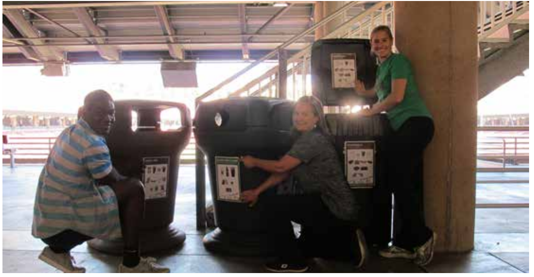
Above- Compost collection and informational signage was piloted at the Stanford Stadium in fall 2016