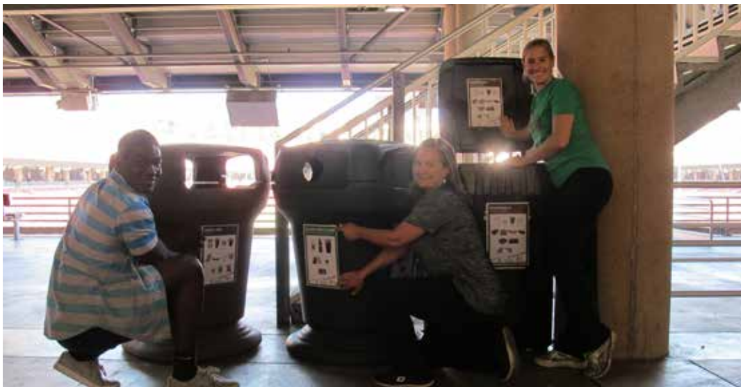
Above- Compost collection and informational signage was piloted at the Stanford Stadium in fall 2016