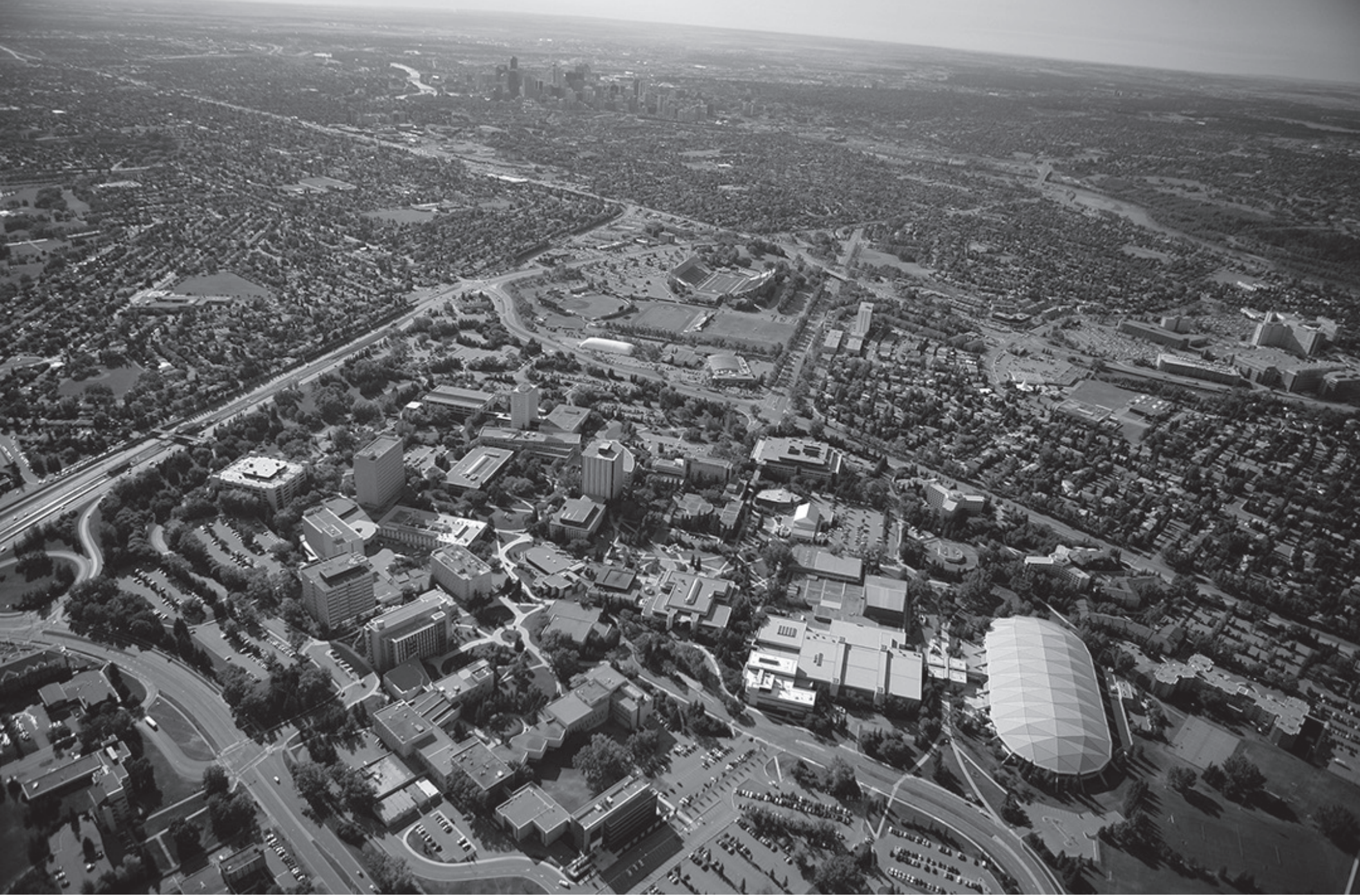
AERIAL IMAGE OF THE MAIN CAMPUS, LOOKING SOUTHEAST TOWARDS DOWNTOWN CALGARY.