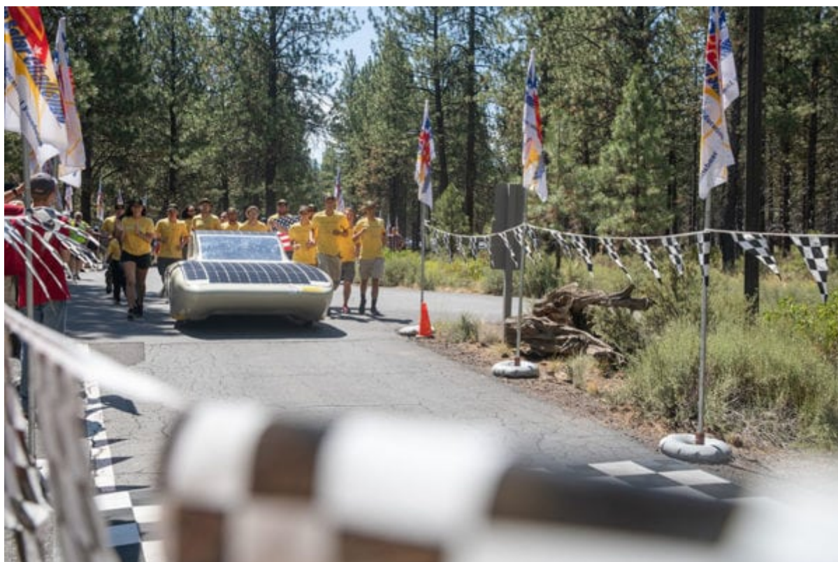
The members of Appalachian's Team Sunergy accompany their new Cruiser Class vehicle, ROSE, across the finish line during the 2018 American Solar Challenge. Team Sunergy tied for second place in the Cruiser Class category.