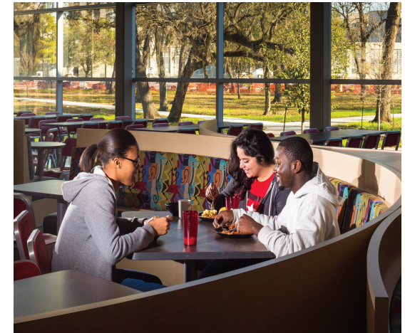
Cougar Woods Dining Hall | LEED Silver