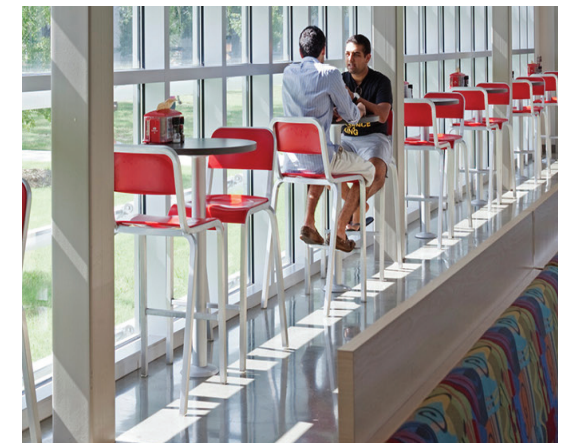
Cougar Woods Dining Hall | LEED Silver