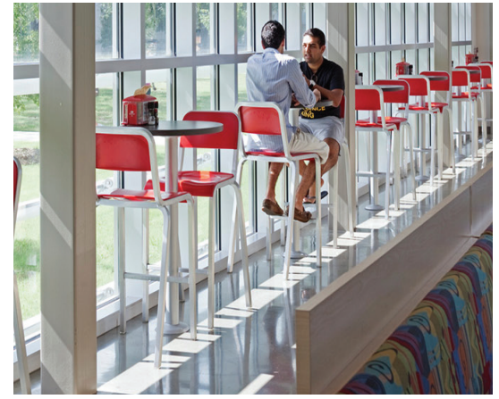
Cougar Woods Dining Hall | LEED Silver