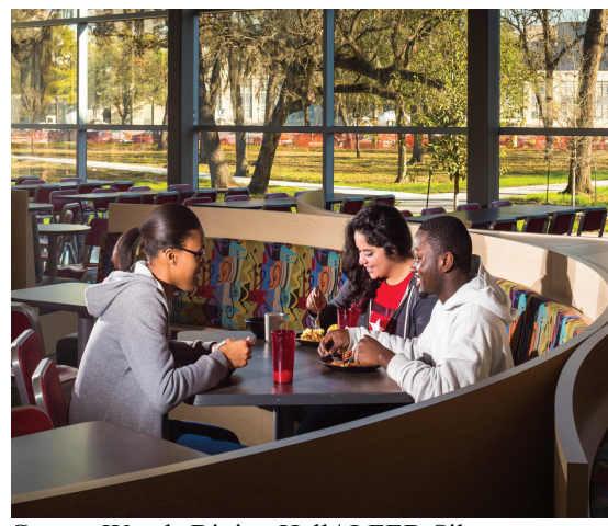
Cougar Woods Dining Hall | LEED Silver