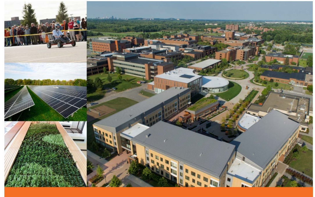
Rochester Institute of Technology 2017 Climate Action Plan