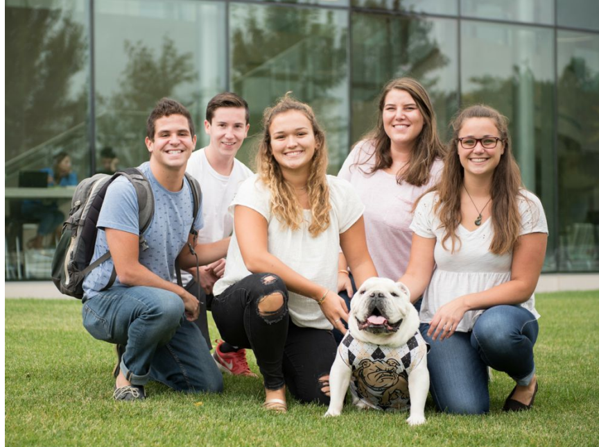
Figure 3 Figure 2 Student Group SustainUs posing with school mascot, Tupper