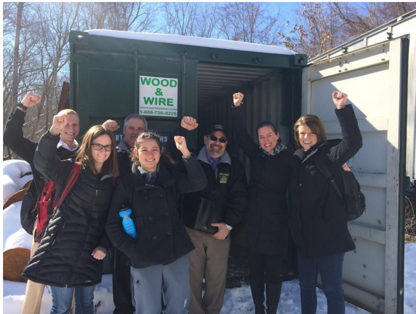
Figure 2 Student group SustainUs Celebrates successful E-waste Recycling Drive 2017

Vice President for Business Affairs/Treasurer