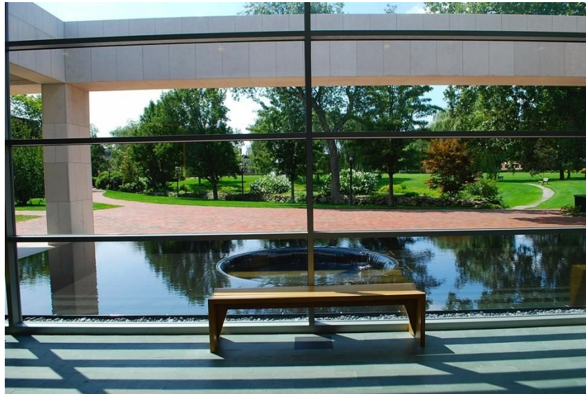
Figure 4 View from the Interfaith Center on Bryant's Smithfield campus

Become member of Fair Labor Association.