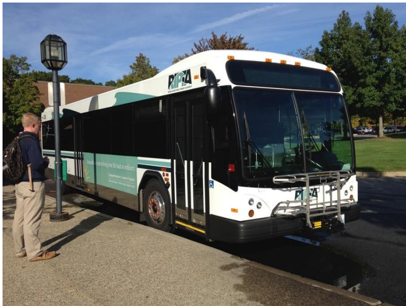
Figure 5 Local transportation authority RIPTA picks up daily on campus at Bryant

Continue to comply to latest RIDEM regulations (treat before discharging) and incorporate more permeable pavement and underground infiltration chambers into campus planning.