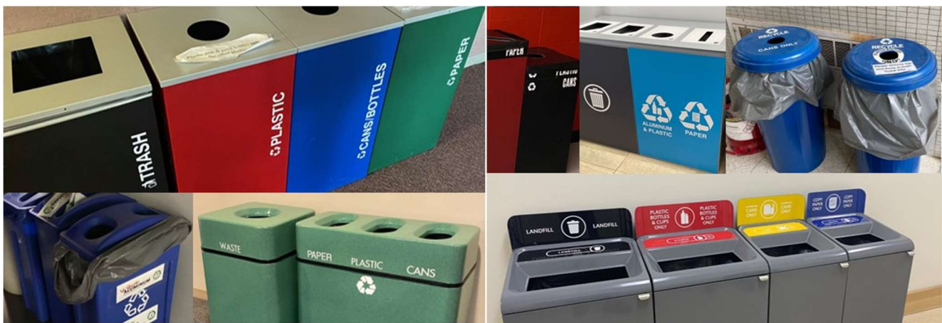
Mismatched waste containers in campus buildings (pre-pilot)