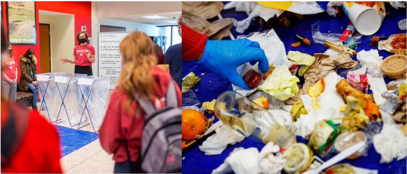
Undergraduate students in Environmental Studies 101 class conducting waste audit