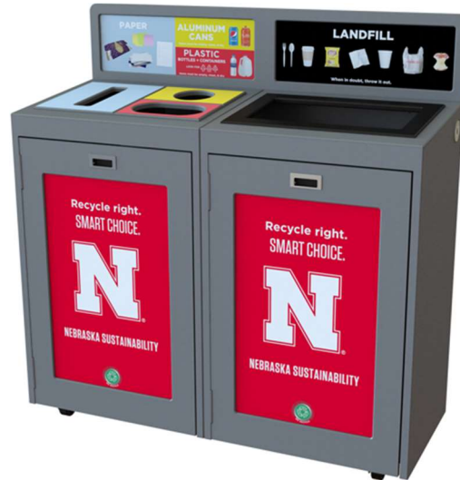
Updated waste stations design (will be implemented as campus standard)