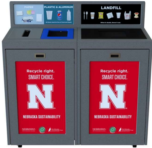
Original waste station design used in Recycling Pilot Project