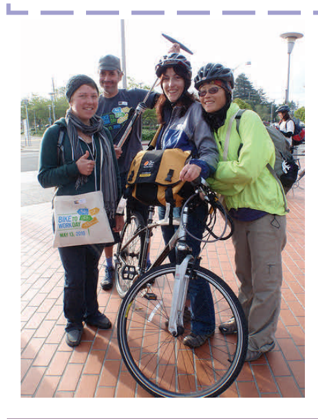
Learn more about the Campus Bike Initiative promoting and celebrating cycling for everyday transportation at UC Berkeley