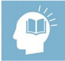
Academics & Educational Experience