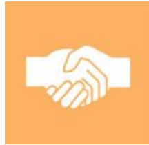
Campus & Community Engagement