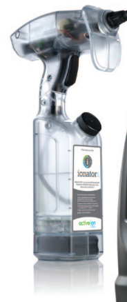
The Ionator EXP™