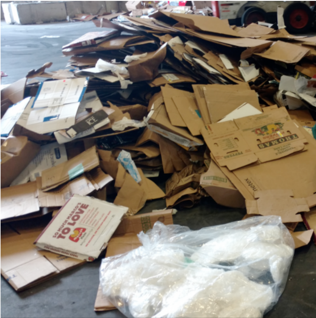
MSU RECYCLING PILOTS INNOVATIVE COLLECTION PLAN AT BRODY HALL

(/news/msu-recycling-pilots-innovative-collection-plan-brody-hall)