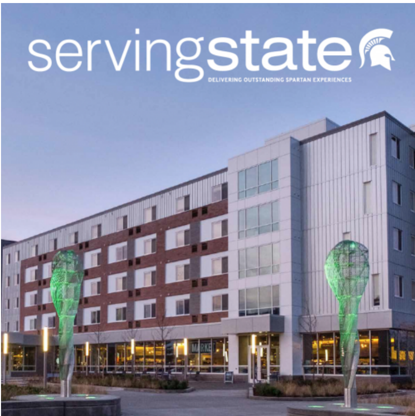
SERVING STATE SPRING 2018

(/news/msu%E2%80%99s-new-clean-cardboard-initiative)