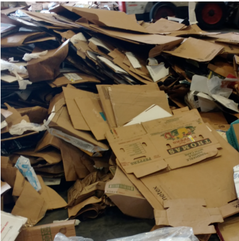
MSU'S NEW CLEAN CARDBOARD INITIATIVE

(/news/msu%E2%80%99s-new-clean-cardboard-initiative)