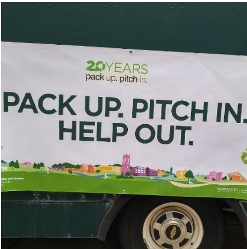
PACK UP. PITCH IN. CELEBRATES 20 YEARS