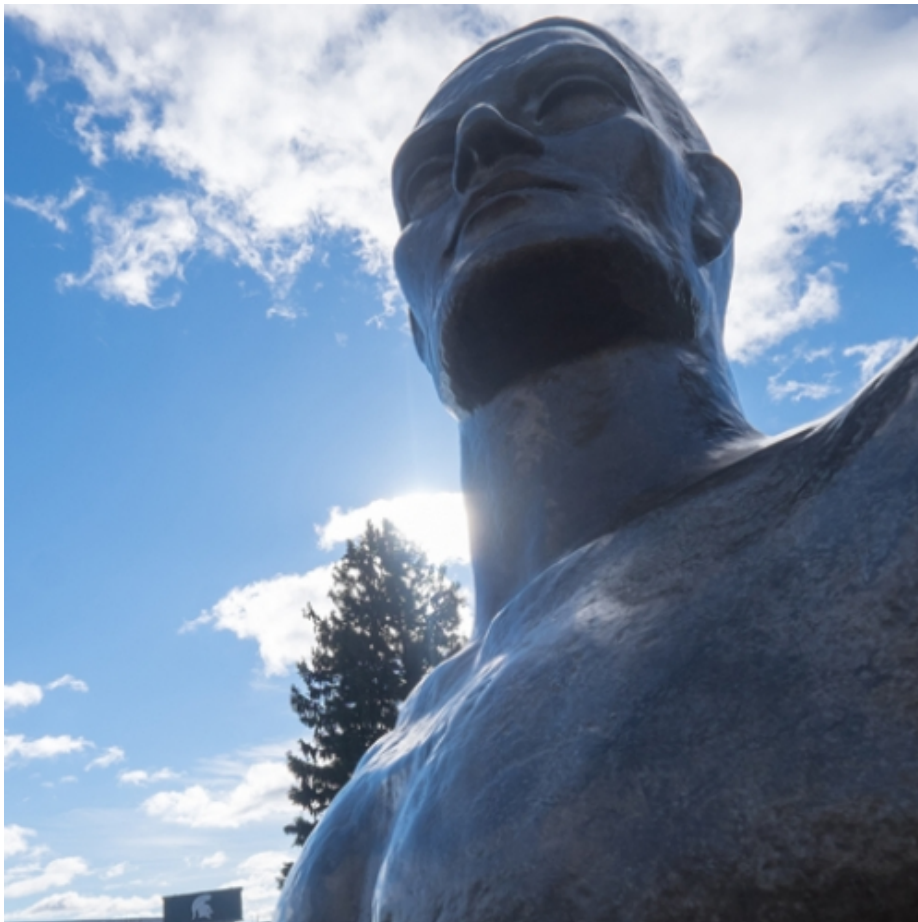
CLEAN PLATES AT STATE ADDRESSES FOOD WASTE AT MSU