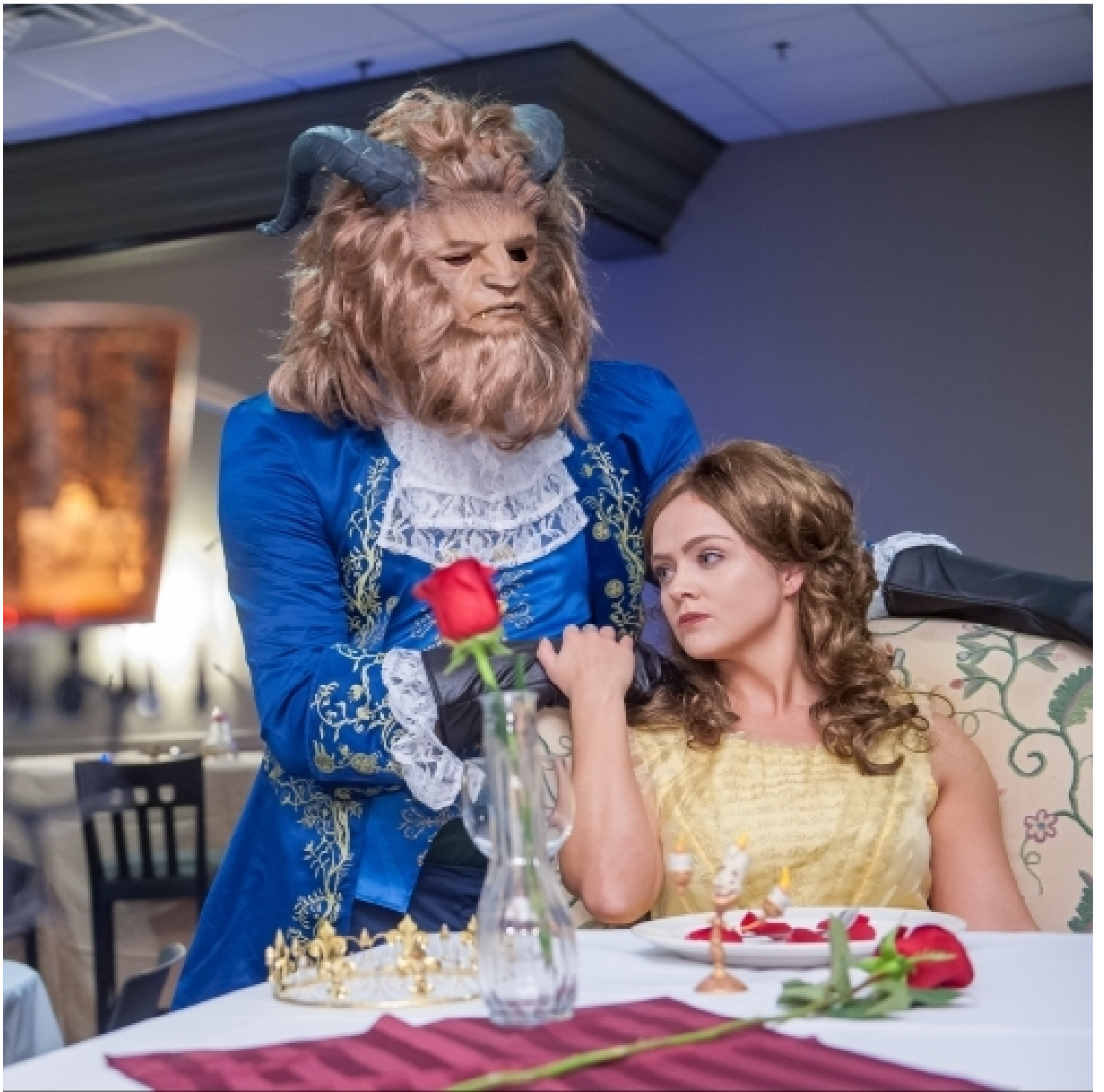
MSU CULINARY SERVICES RECOGNIZED NATIONALLY FOR ON-CAMPUS MARKET AND SPECIAL THEMED DINNER

(/news/msu-culinary-services-recognized-nationally-campus-market-and-special-themed-dinner)