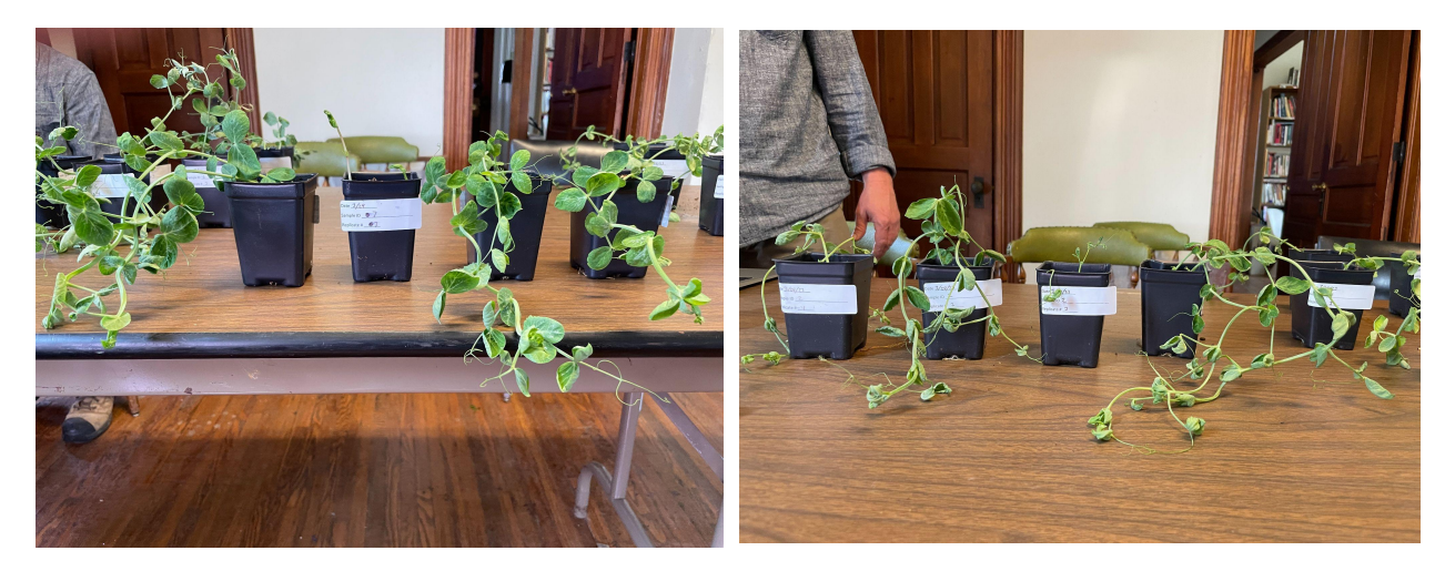
Figure 7: (April 13, 2023) Compost from the second batch of Knoxville Compost Figure 8: (April 13, 2023) Spiked Compost control

2005). Above are a few pictures of the plants after the 15 day period. The picture on the left shows compost from the Knoxville batch and the picture on the right shows plants from the Spiked compost. As you can see from the picture on the left, the plant looks very healthy, except for some of the leaves at the top of the plants. Those leaves are showing leaf cupping. The spiked compost shows severe leaf cupping. These two pictures are good representations of not only a healthy plant and an unhealthy plant, but also the effects of herbicides on plants.