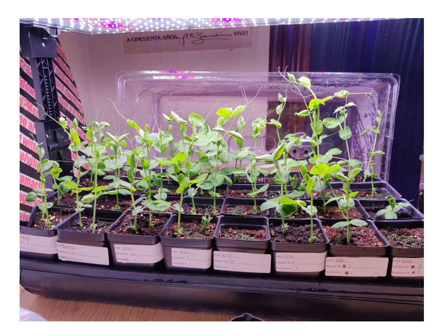
Figure 1: Picture of plants on April 10, 2023. This was on the 12th day of the 15 day observation period.

Composting is a sustainable practice to turn organic waste into a soil amender that promotes plant growth and quality. Organic waste consists of yard trimmings, leaves, and food waste. The composting process has been proven to help reduce herbicide residues to a low enough concentration that it is harmless to plants. However, some herbicides have half-lives that out-live the time that it takes for organic waste to break down in the composting process. These herbicides are defined as 'Persistent Herbicides' and they effect plants at low concentrations. Persistent herbicides can affect plants at a concentration of 1 ppb (The United States Composting Council, 2015). For this research, a bioassay kit provided by the Compost Research and Education Foundation was used to test compost from the Knox Farm, a home compost batch, and two different batches from Better Earth Composting–an Industrial Compost company close to Galesburg. The target audience for this research is mainly compost consumers and producers of compost, both on the large scale and small scale level.