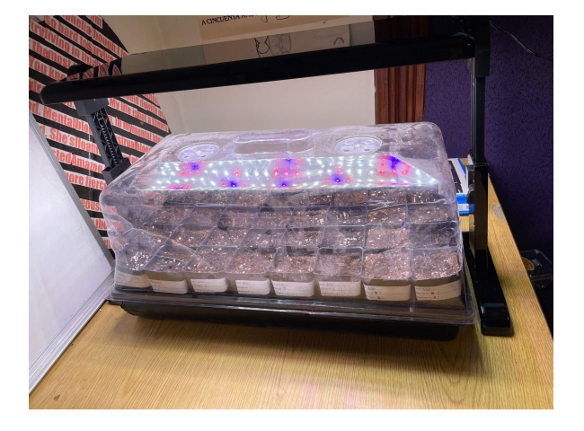
Figure 5: Template for the placement of the soil cups in the tray

Figure 6: Final set up of the tray and grow light (March 29, 2023)