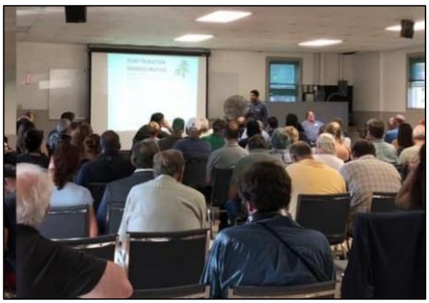
Hemp Production Growers Meeting on June 26, 2019 at UConn Tolland County Extension Center