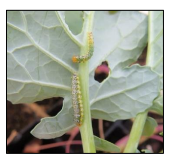
Cross-striped cabbageworm on broccoli

Wallace, V. Connecticut School IPM Coalition and School IPM Workshop. In cooperation with CT DEEP and School Districts in Connecticut. USDA NIFA CPPM EIP.