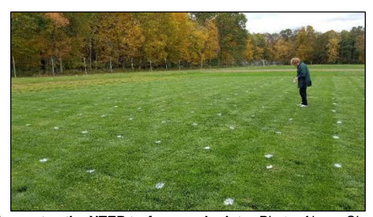
V. Wallace rates the NTEP turf research plots.

Year 1 data of a 5-year evaluation trial of Turf-type tall fescue was collected. Turf quality of the tall fescue cultivars was evaluated. UConn serves as an evaluation location for this national turfgrass evaluation program.