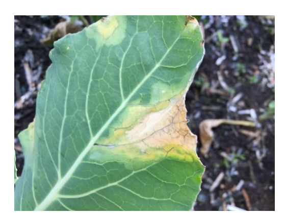
Black rot symptom on a cabbage leaf