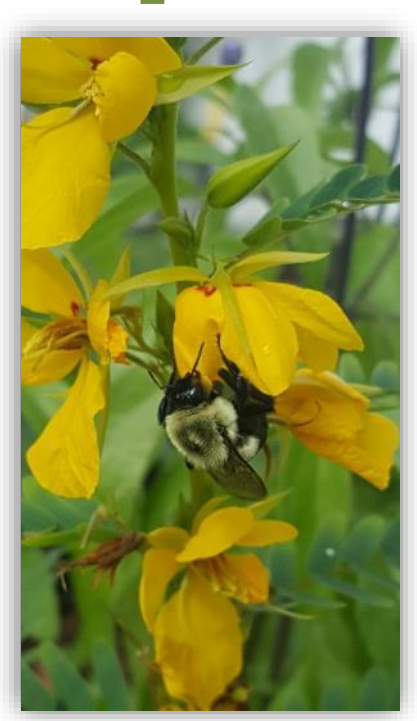
Department of Extension

Department of Plant Science & Landscape Architecture www.ipm.uconn.edu