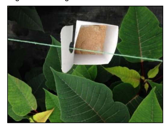
Poinsettia crop grown with the use of biological controls.

111 training sessions were conducted, to wholesale and retail greenhouses with 1,566,088 square ft. of intensive greenhouse production and 1,021,000 square ft. of outdoor container production.