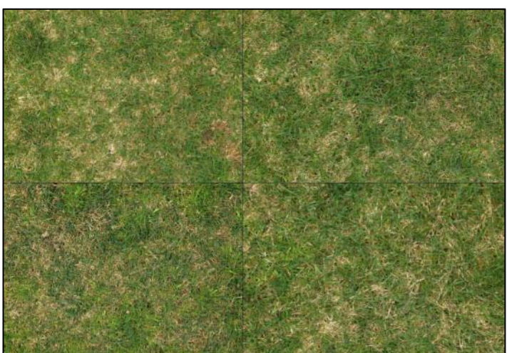
ALIST evaluation, Storrs, CT (left). Four light box photos of turf plots to assess percent cover ratings (right).