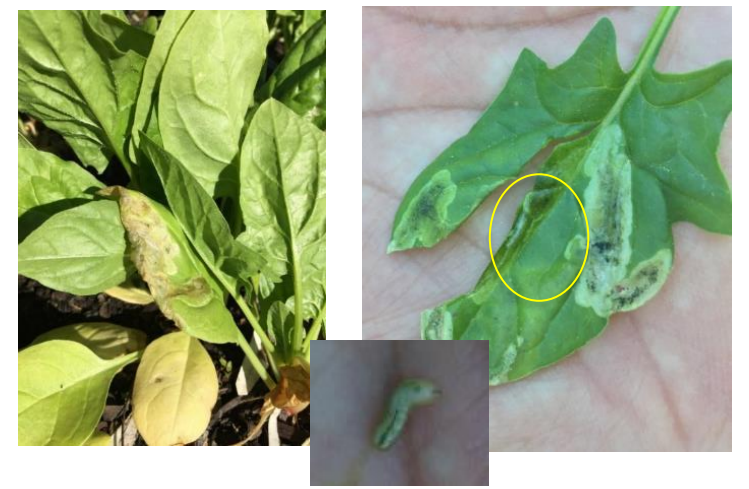
Spinach leafminer injury and larva

Weekly vegetable pest alerts focusing on pests, pest management and decision-making, and safe pesticide use were delivered to over 550 subscribers via the UConn Extension Vegetable IPM Program listserv from May through September 2019. These pest alerts are also posted on UConn IPM website Vegetable Pest Messages.