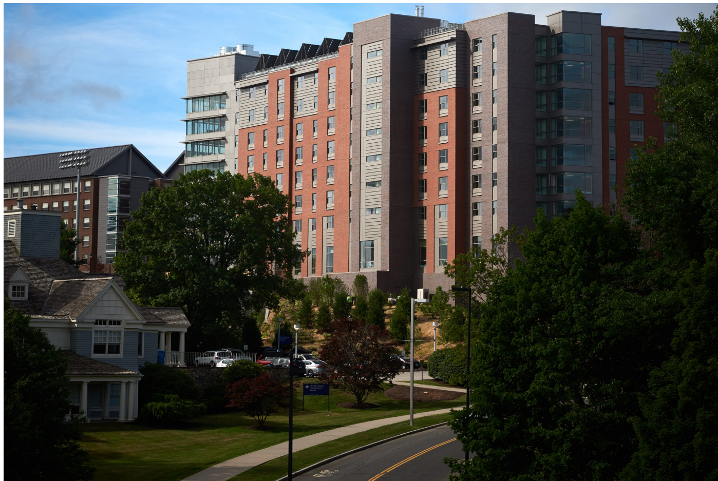
NextGen Hall, a new 727-bed residence hall, is the first building completed under the Next Generation Connecticut initiative. It officially opens today.