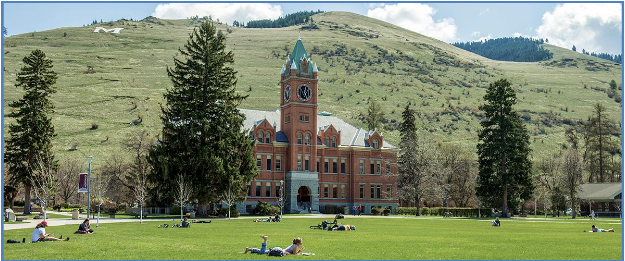
University of Montana, Missoula Campus