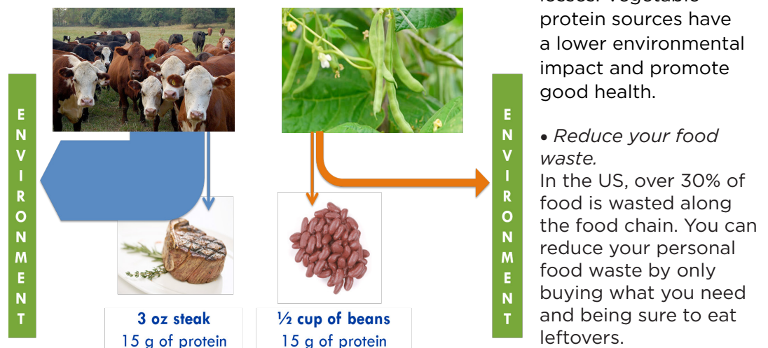
FIGURE 2. The food consumption and food production nitrogen footprints for a 3 oz steak and 1/2 cup of beans. The food consumption nitrogen footprints are identical, but the food production nitrogen footprint of the beef product is substantially larger than that of the beans.