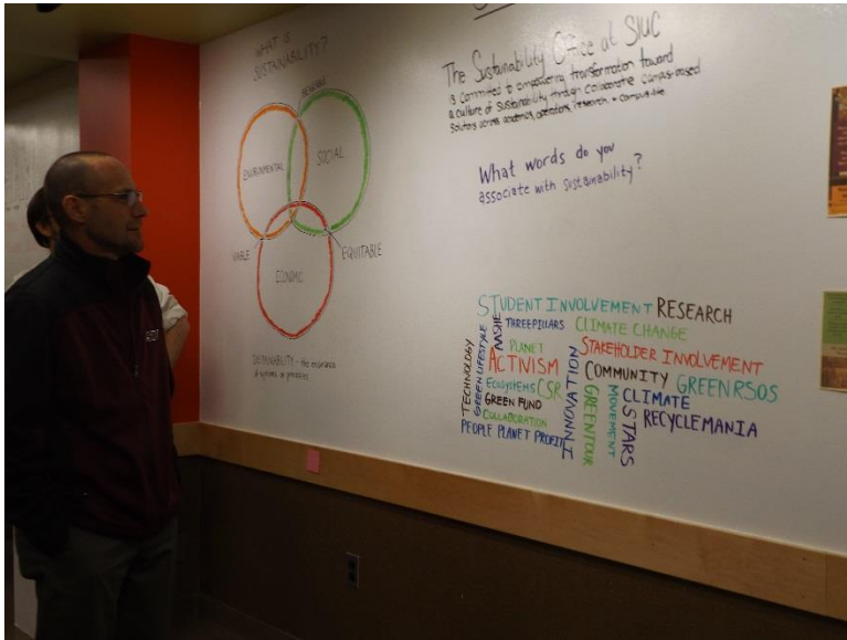
A faculty member views one of the white board walls.