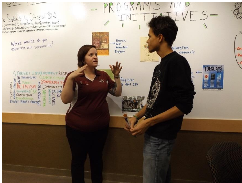
A Sustainability graduate assistant explains the role of the Sustainability Office to a fellow student.