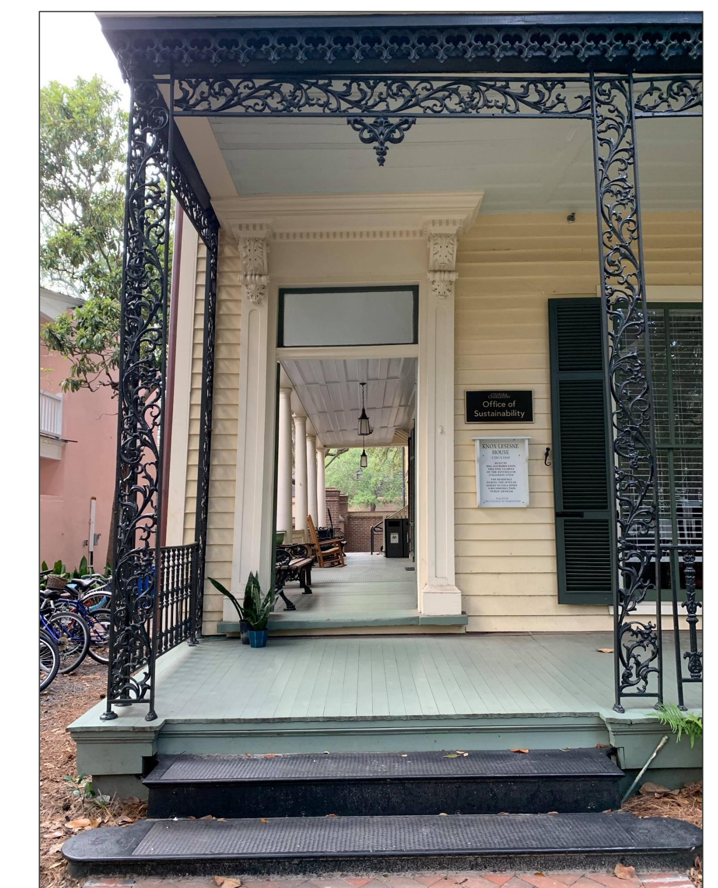
Image 3. Inaccessible front entrance to the OoS. After submitting Barrier Notification Forms, ramps were installed in the back.